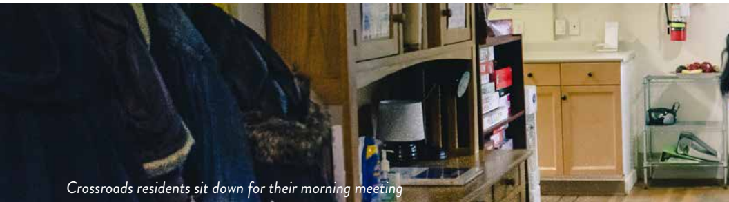
Crossroads residents sit down for their morning meeting

Home is where recovery begins. Coast Mental Health connects people living with severe and persistent mental illness with secure housing as an essential part of their recovery. Today, we provide a continuum of residential care services to over 1,100 people at 48 sites throughout the lower mainland.