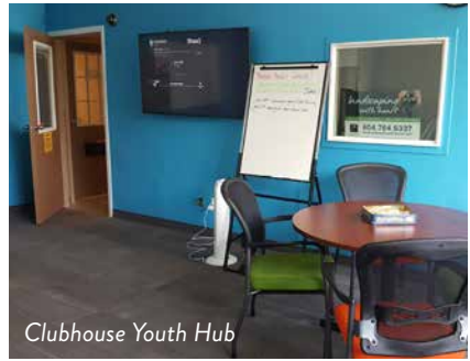
Clubhouse Youth Hub

Early in 2018, we created a vibrant youth hub in the Clubhouse. Designed to encourage young people to engage longer with mental health teams and peers, it features upgraded technology and software to engage youth and promote e-learning.