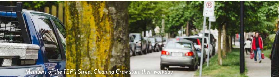
Members of the TEP's Street Cleaning Crew start their workday

Employment is both a driver and an indicator of recovery for people living with mental illness. Coast Mental Health provides an array of employment and education programs that help connect people with the skills and opportunities they need to pursue meaningful occupations, and participate in their communities.